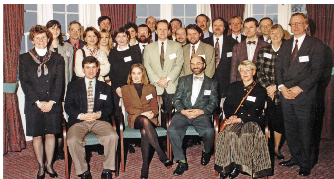
1996: 1st IQ-Net meeting in Ross Priory, Scotland, UK