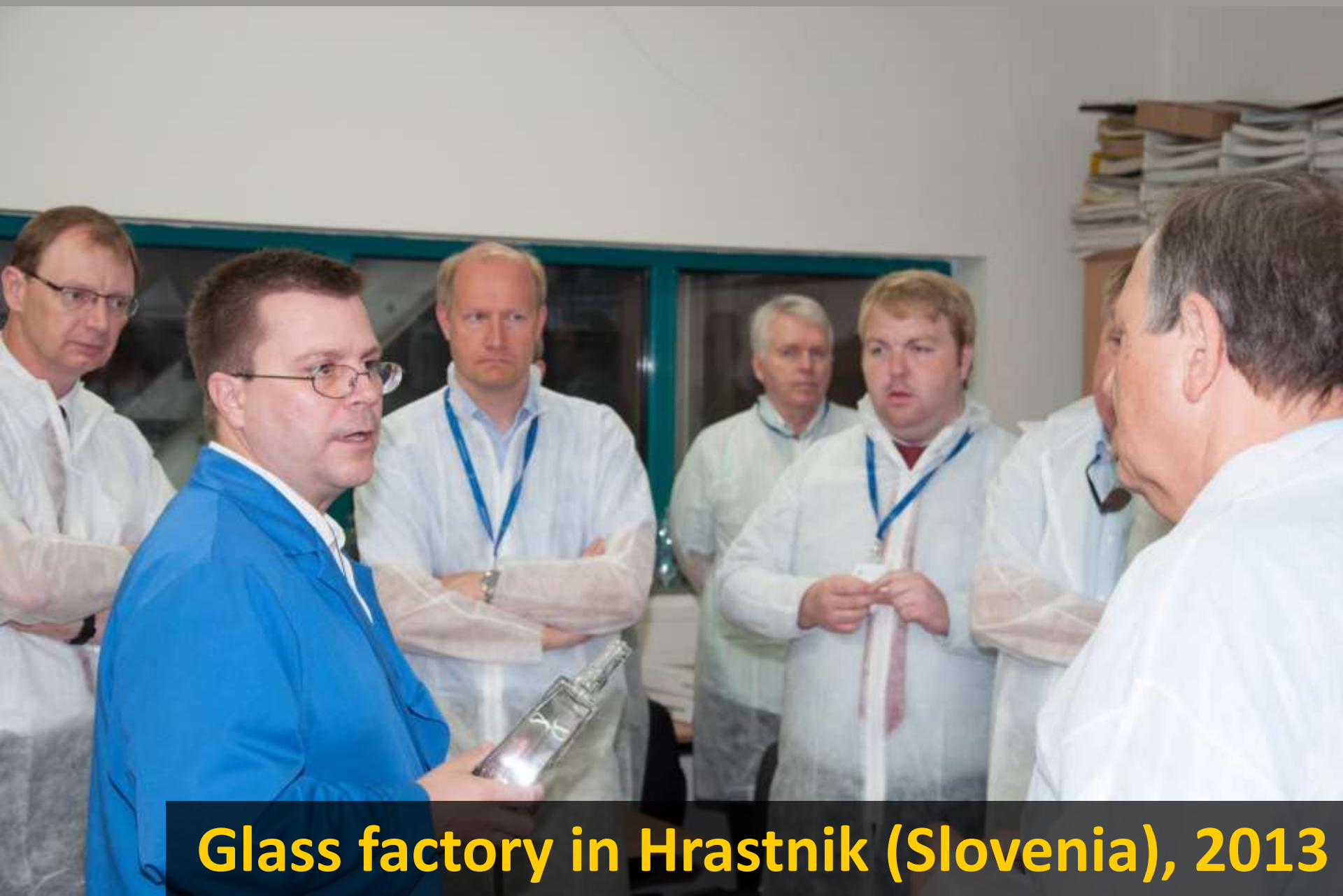
Glass factory in Hrastnik (Slovenia), 2013