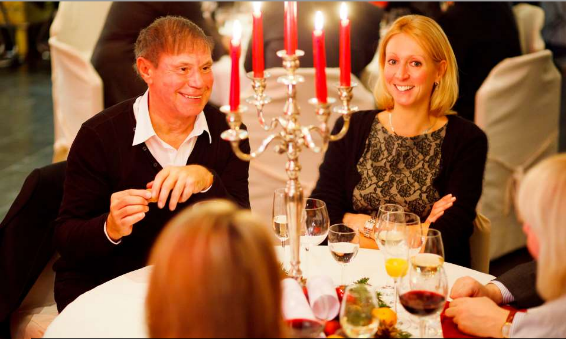
Conference dinner, Aachen (Germany), 2011