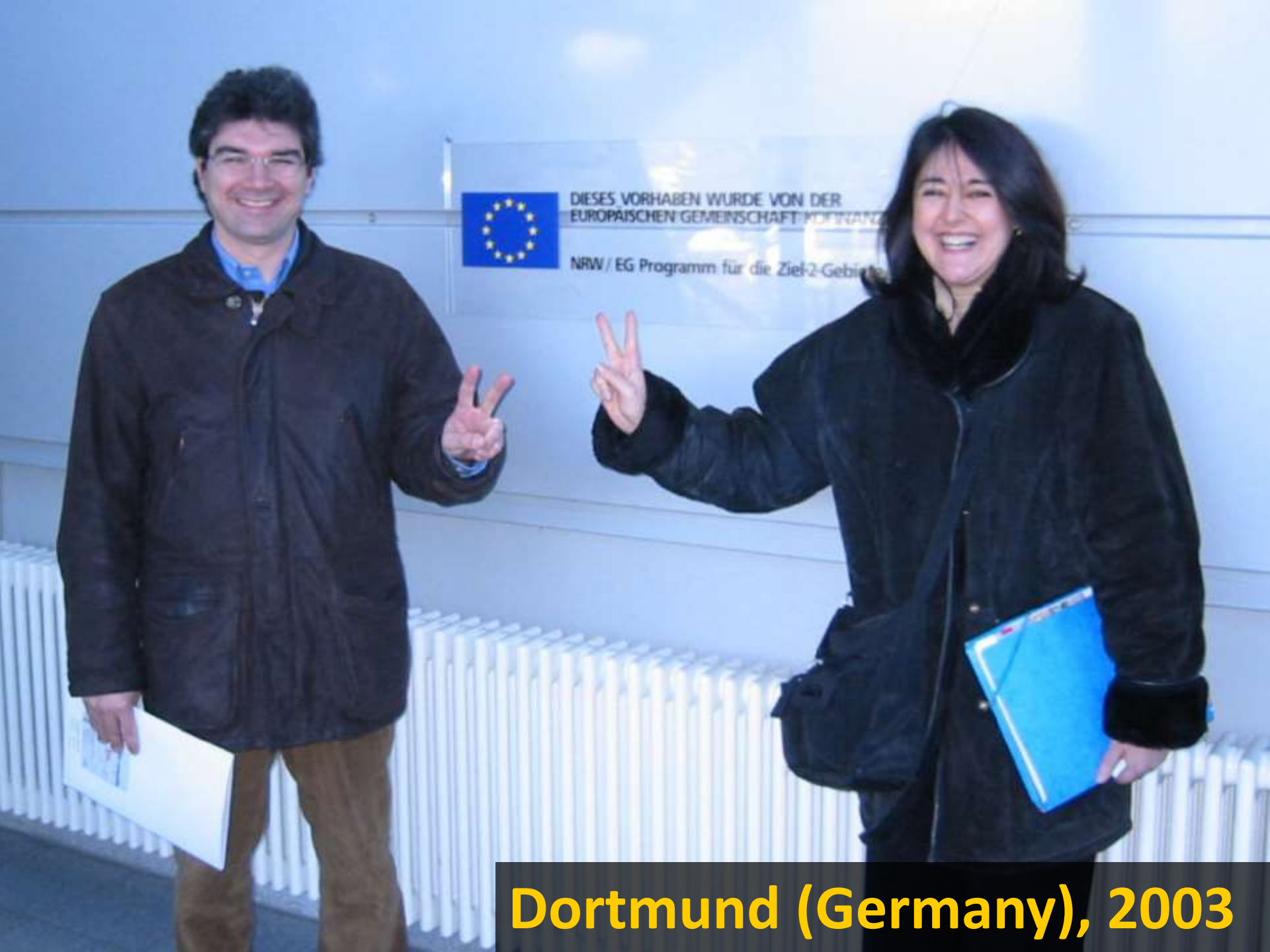
Dortmund (Germany), 2003