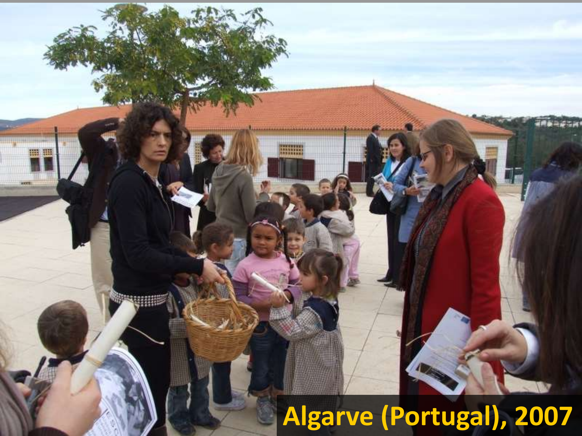
Algarve (Portugal), 2007