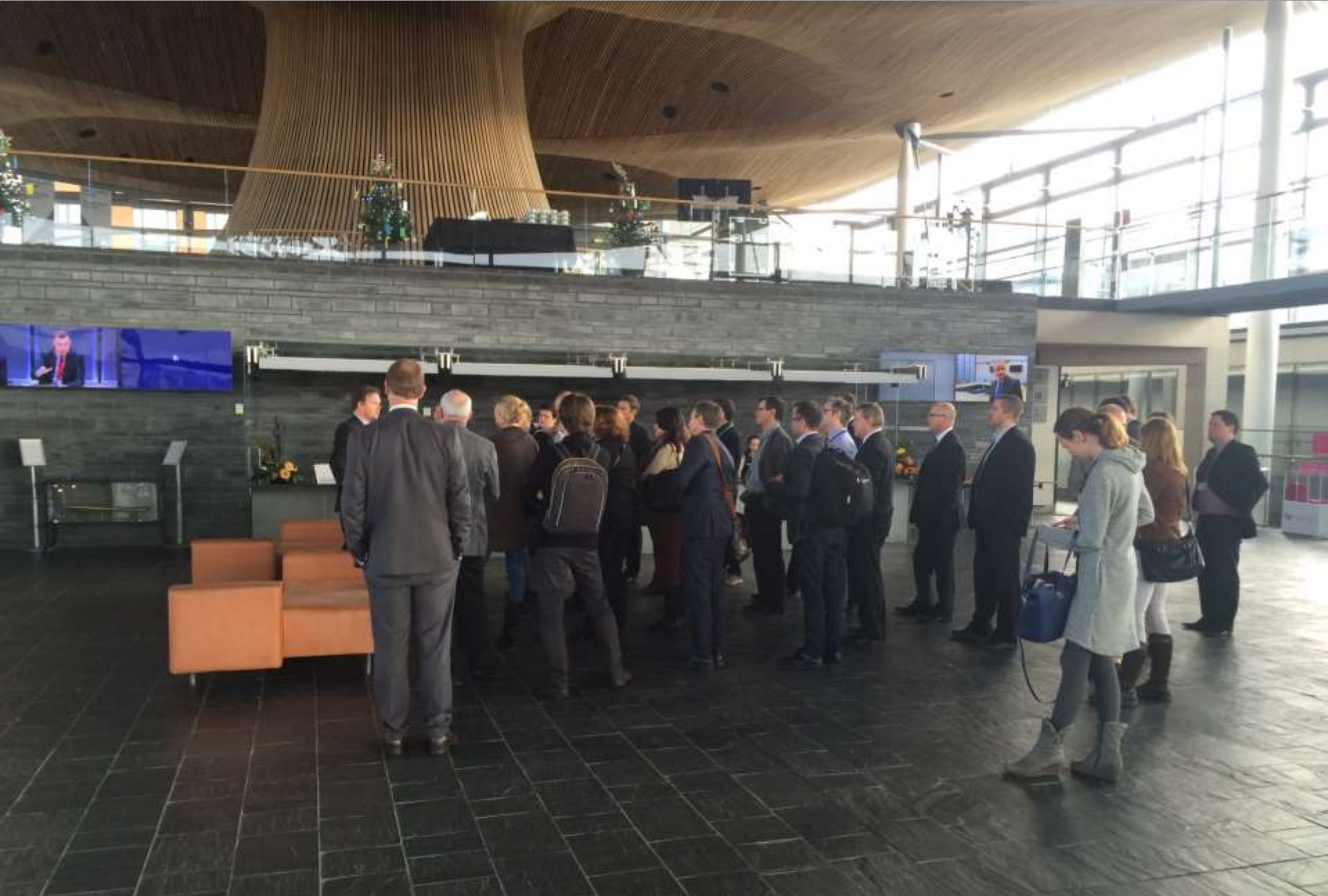
The Welsh Assembly, Cardiff (Wales), 2015