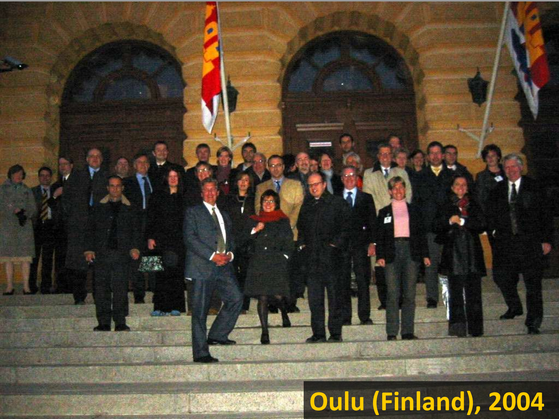
Oulu (Finland), 2004