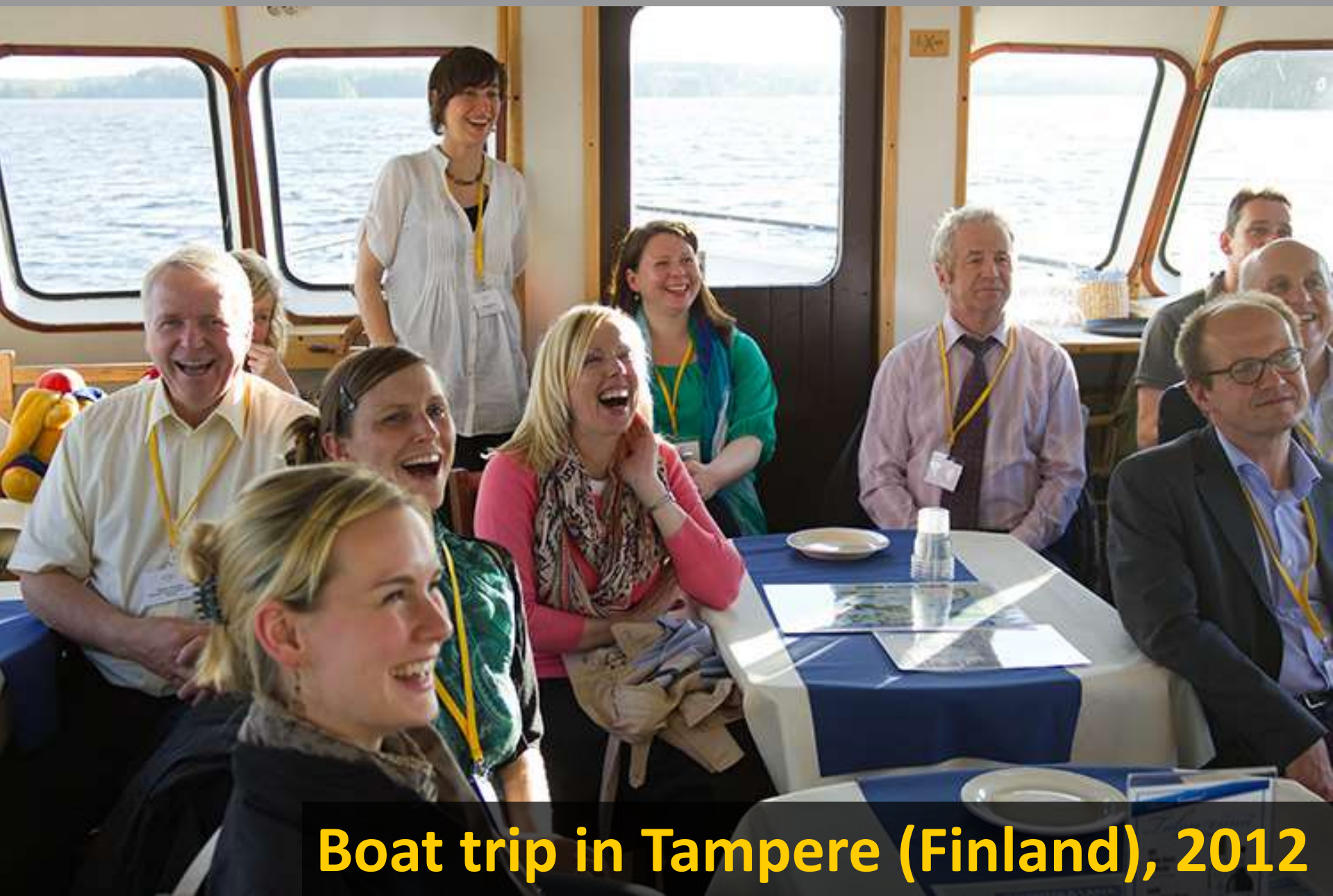
Boat trip in Tampere (Finland), 2012