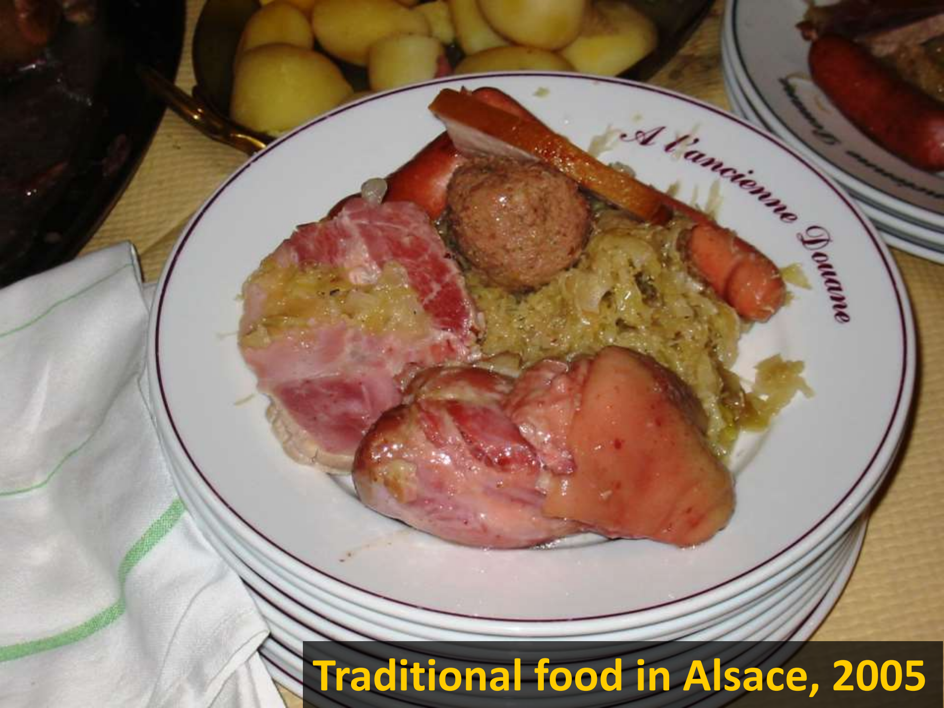
Traditional food in Alsace, 2005