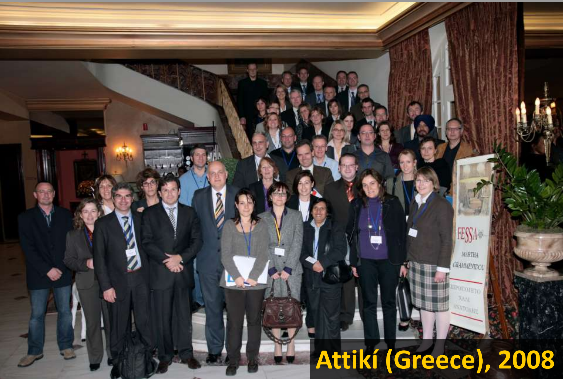
Attikí (Greece), 2008