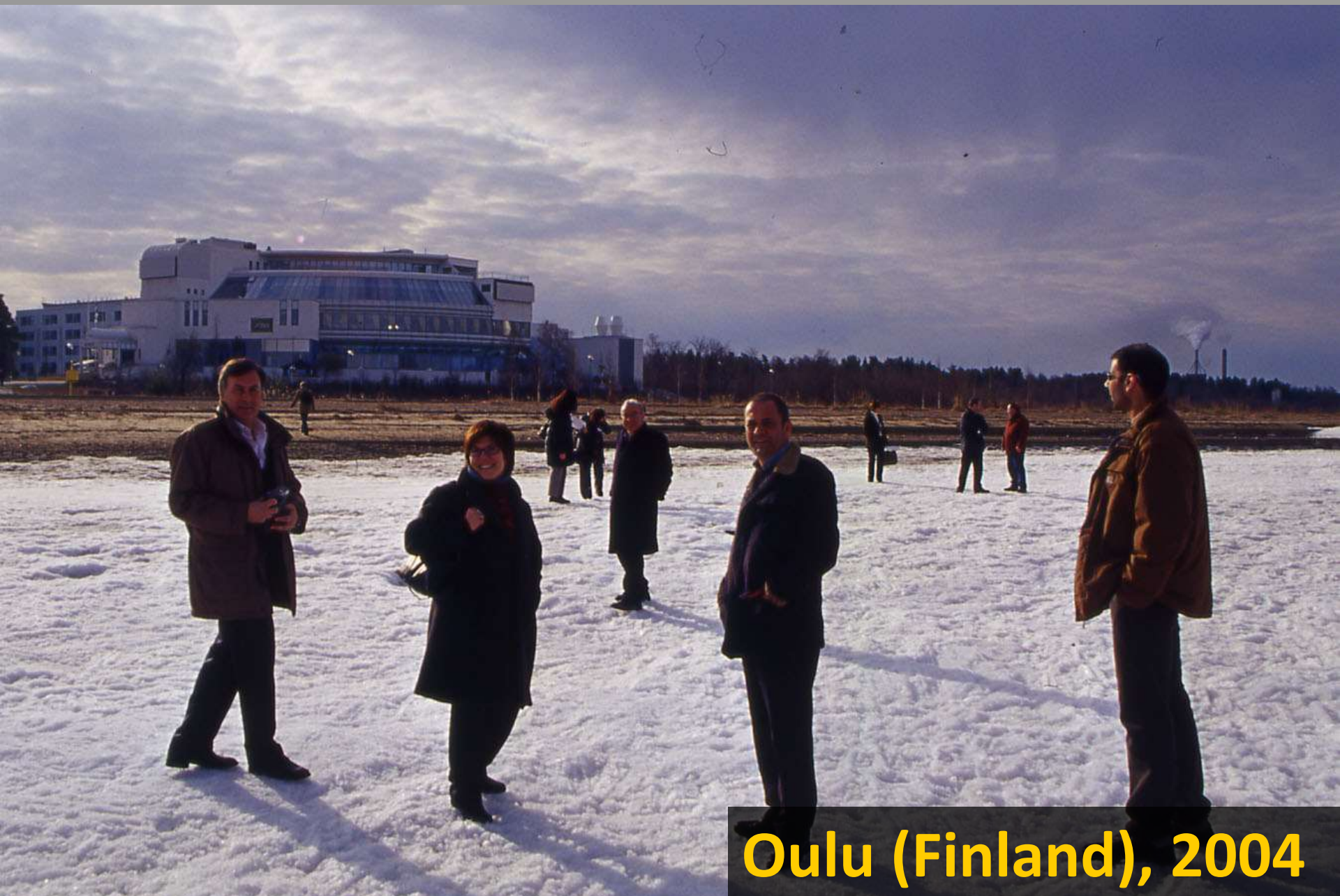
Oulu (Finland), 2004