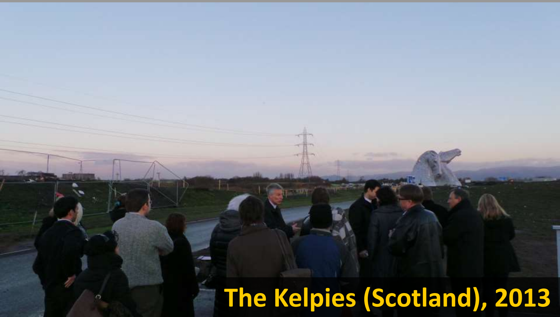
The Kelpies (Scotland), 2013