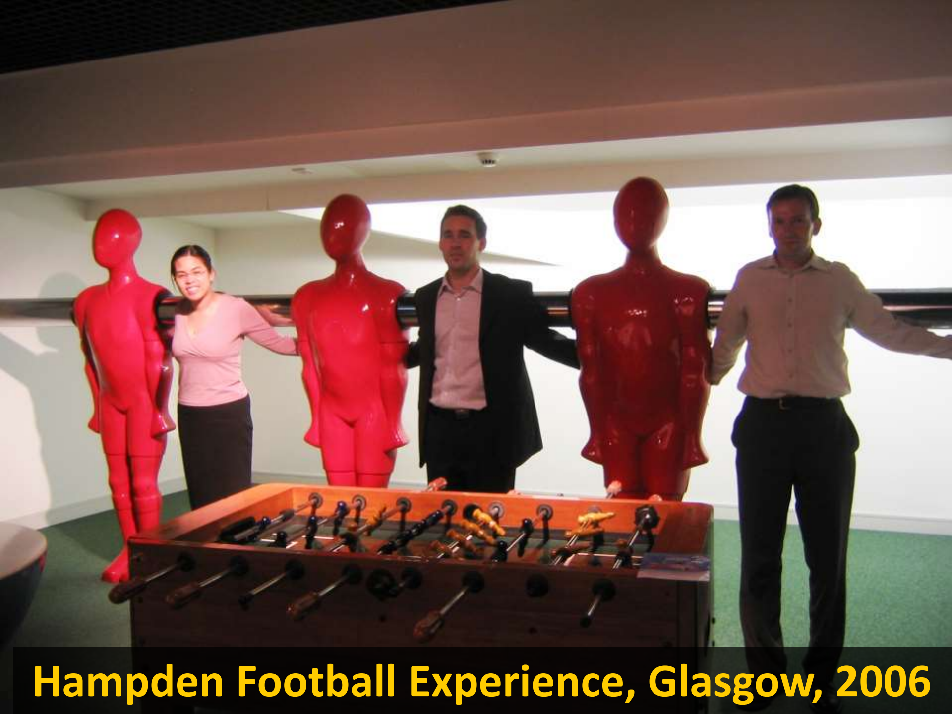
Hampden Football Experience, Glasgow, 2006