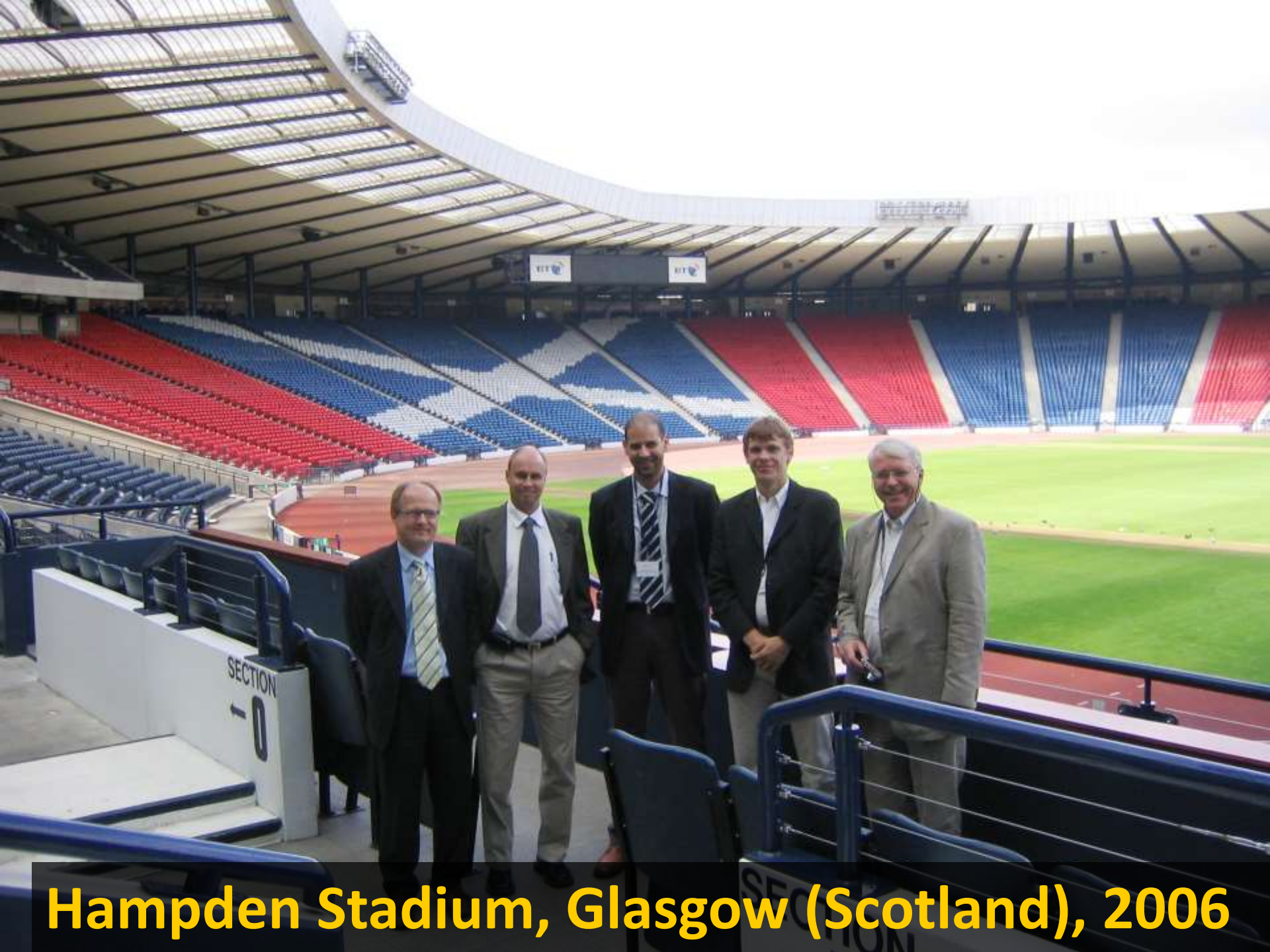
Hampden Stadium, Glasgow (Scotland), 2006