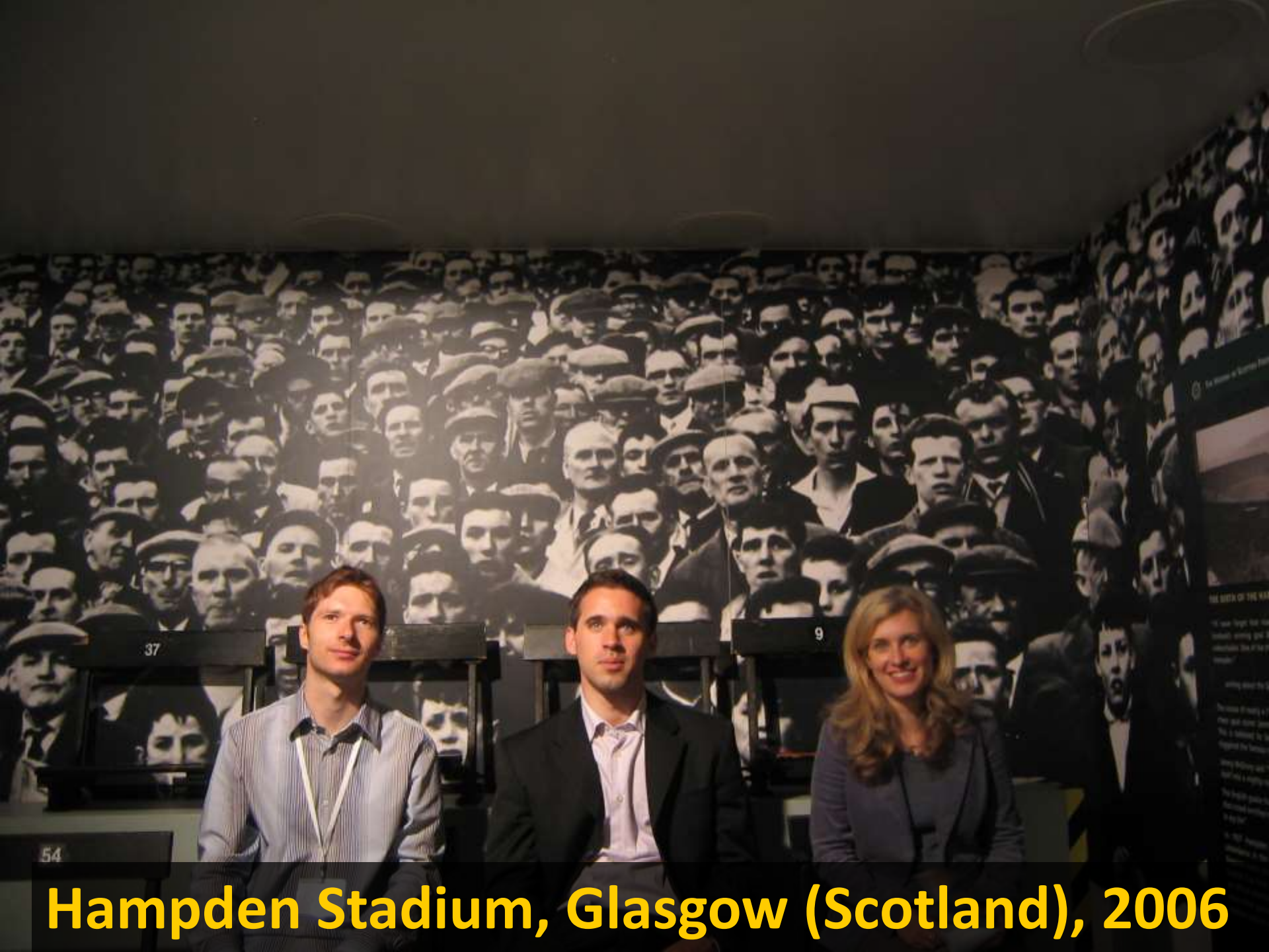
Hampden Stadium, Glasgow (Scotland), 2006