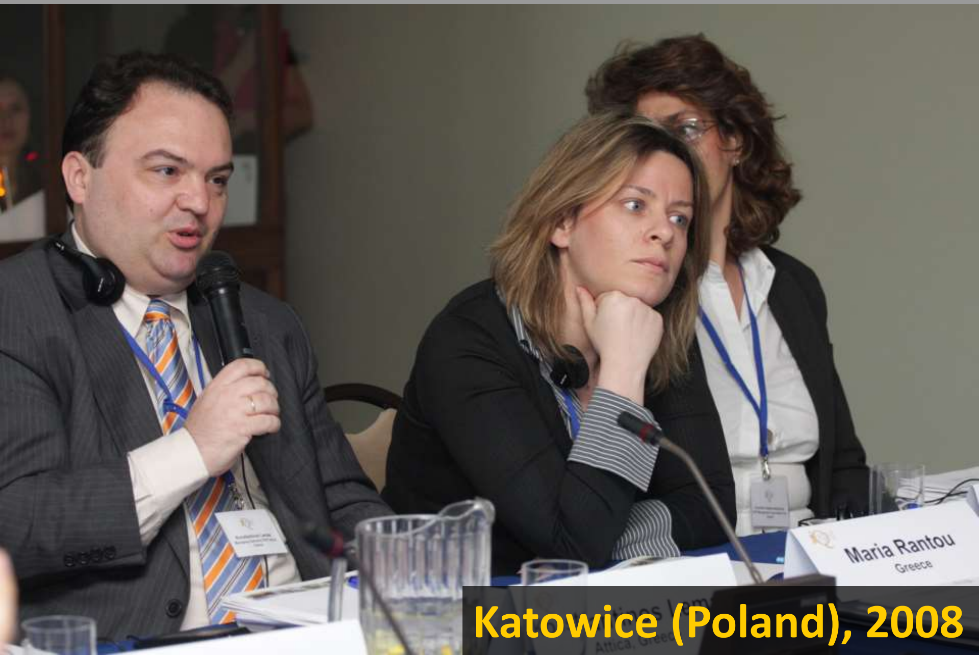
Katowice (Poland), 2008