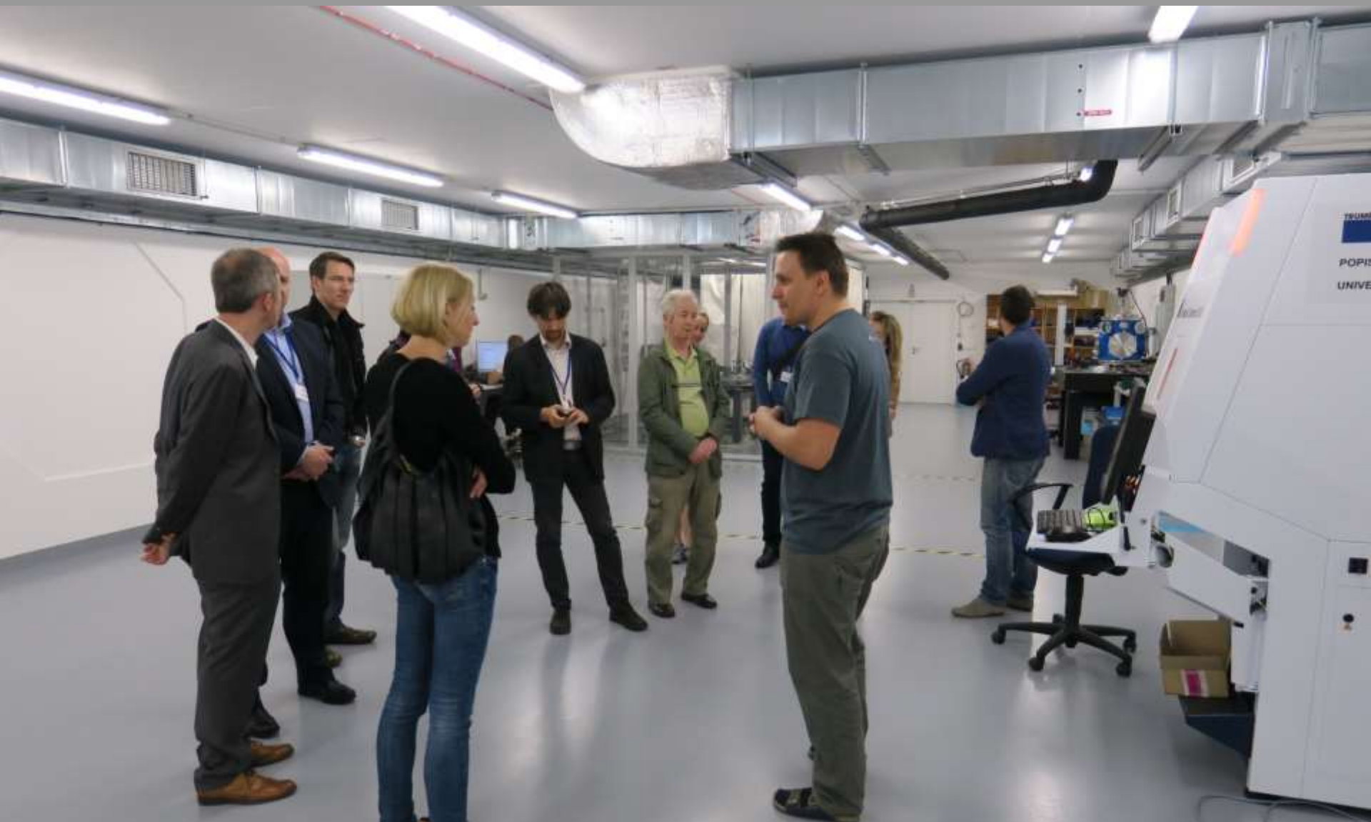
Laser research centre (Czech Republic), 2016