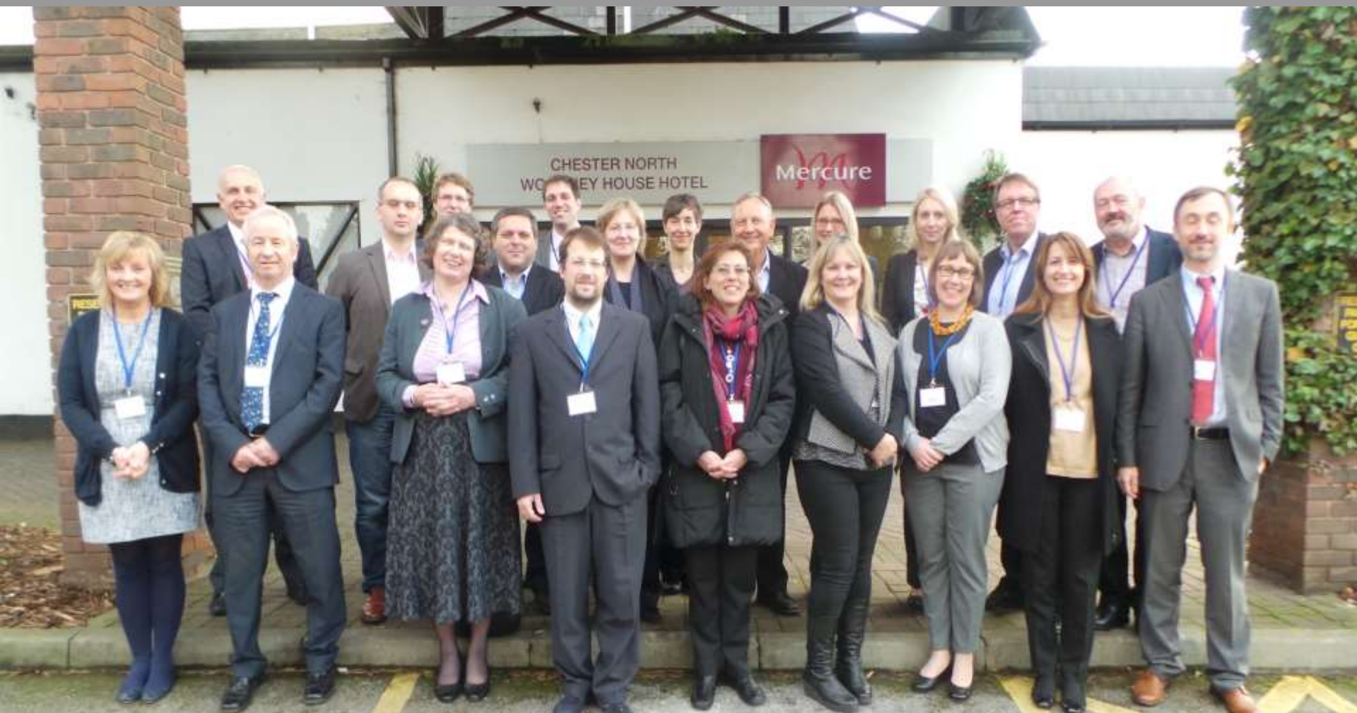
Little Sutton (England), 2014