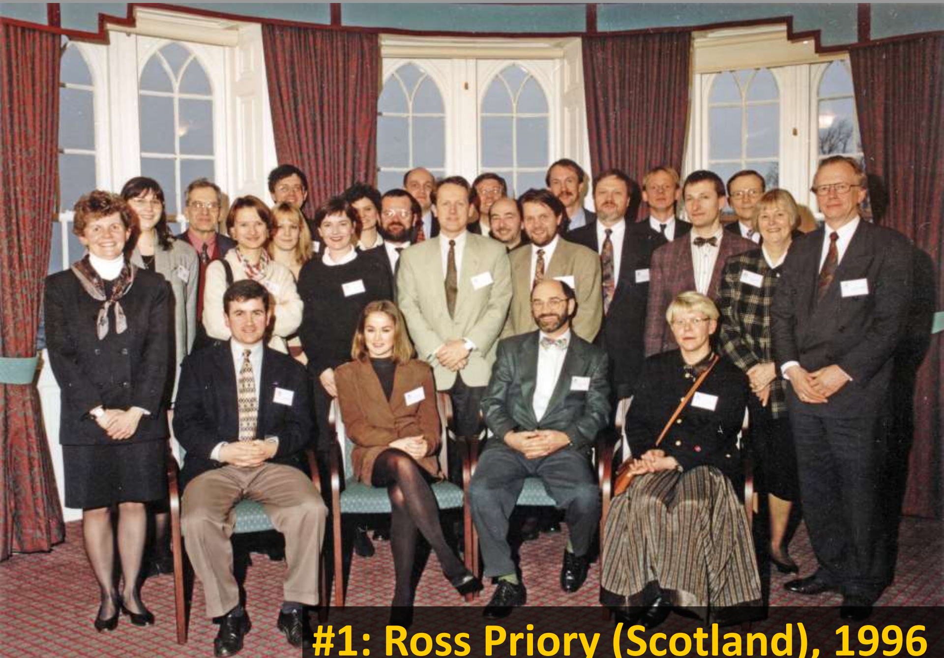
#1: Ross Priory (Scotland), 1996