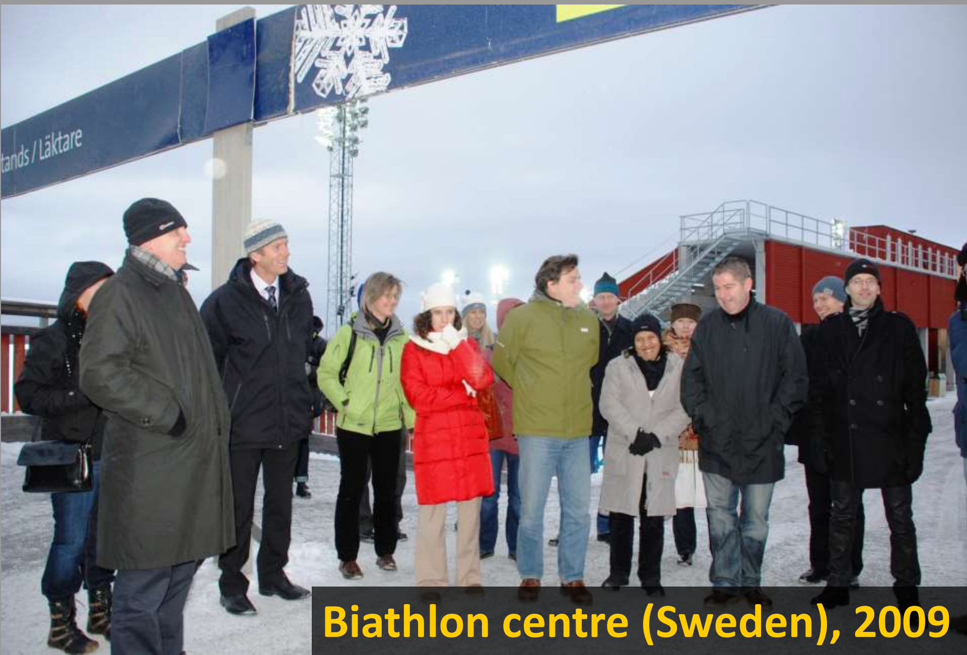
Biathlon centre (Sweden), 2009