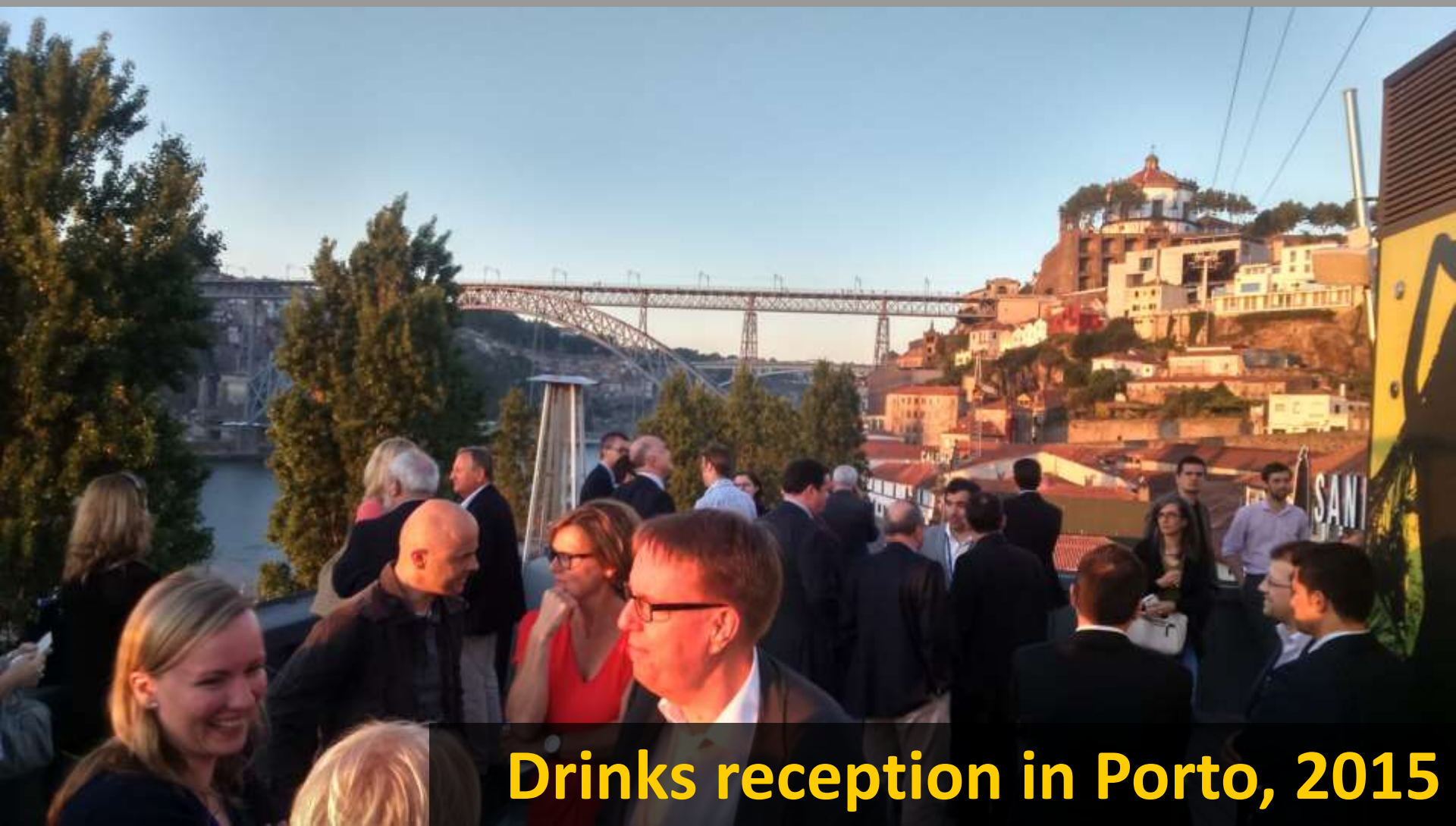
Drinks reception in Porto, 2015