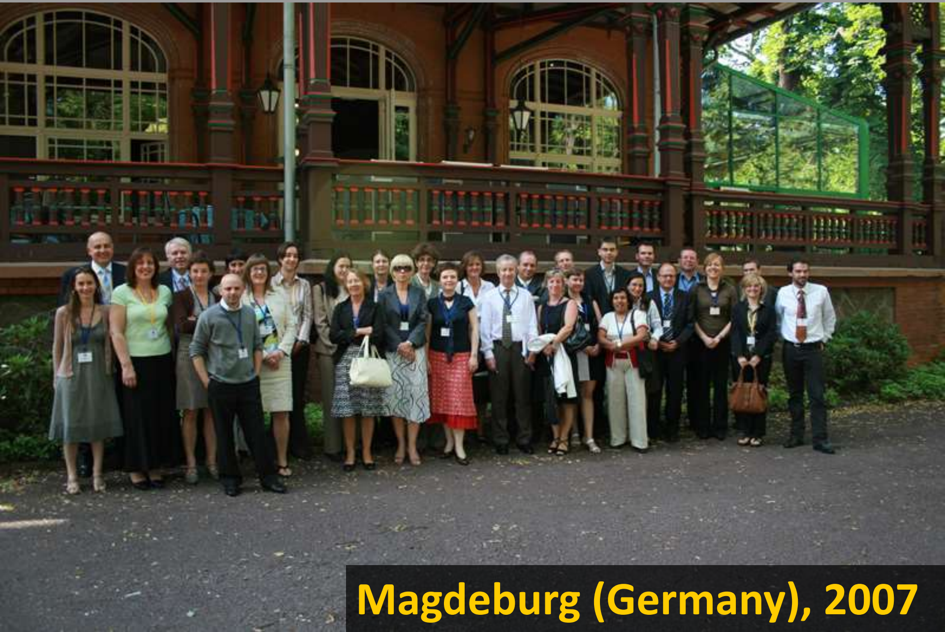
Magdeburg (Germany), 2007