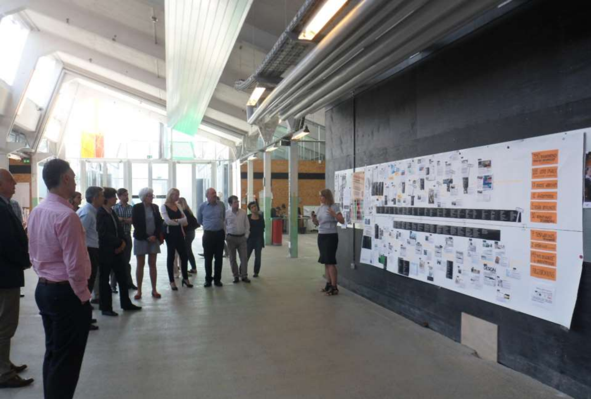
Transformer Centre, Vejle (Denmark), 2014