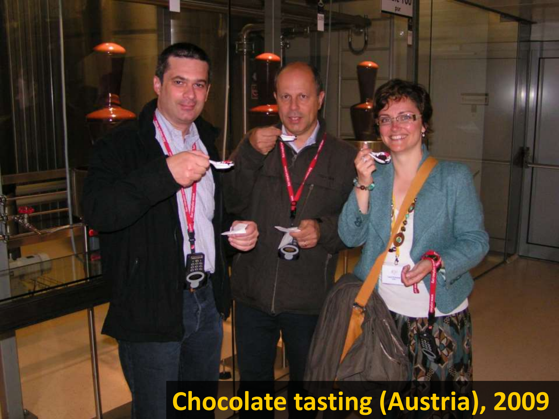
Chocolate tasting (Austria), 2009