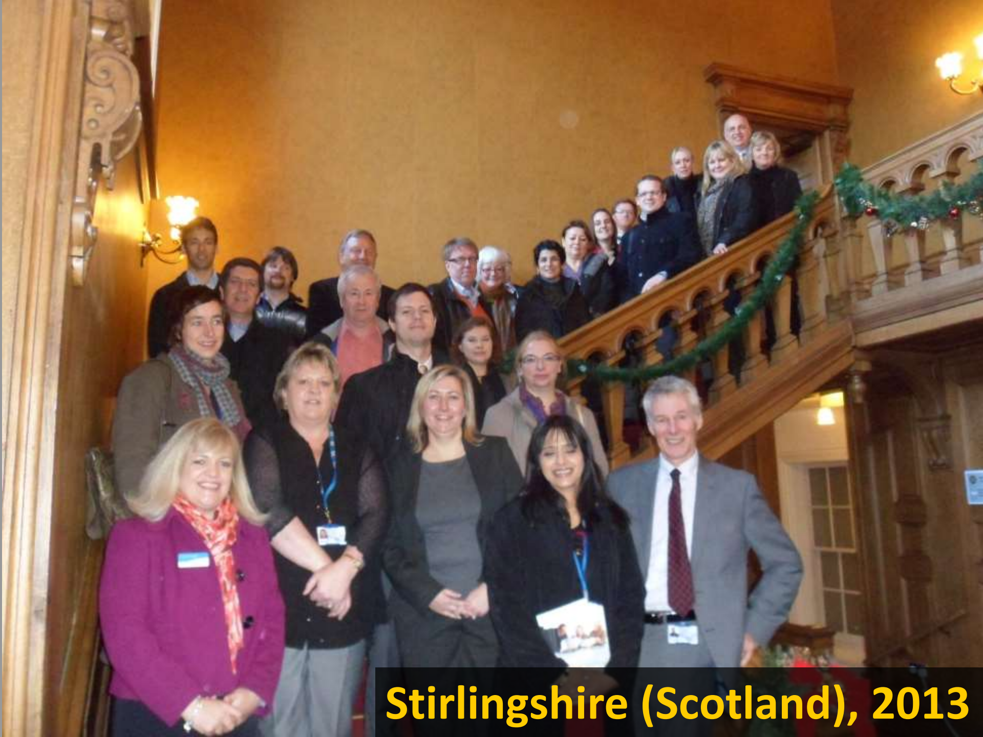
Stirlingshire (Scotland), 2013