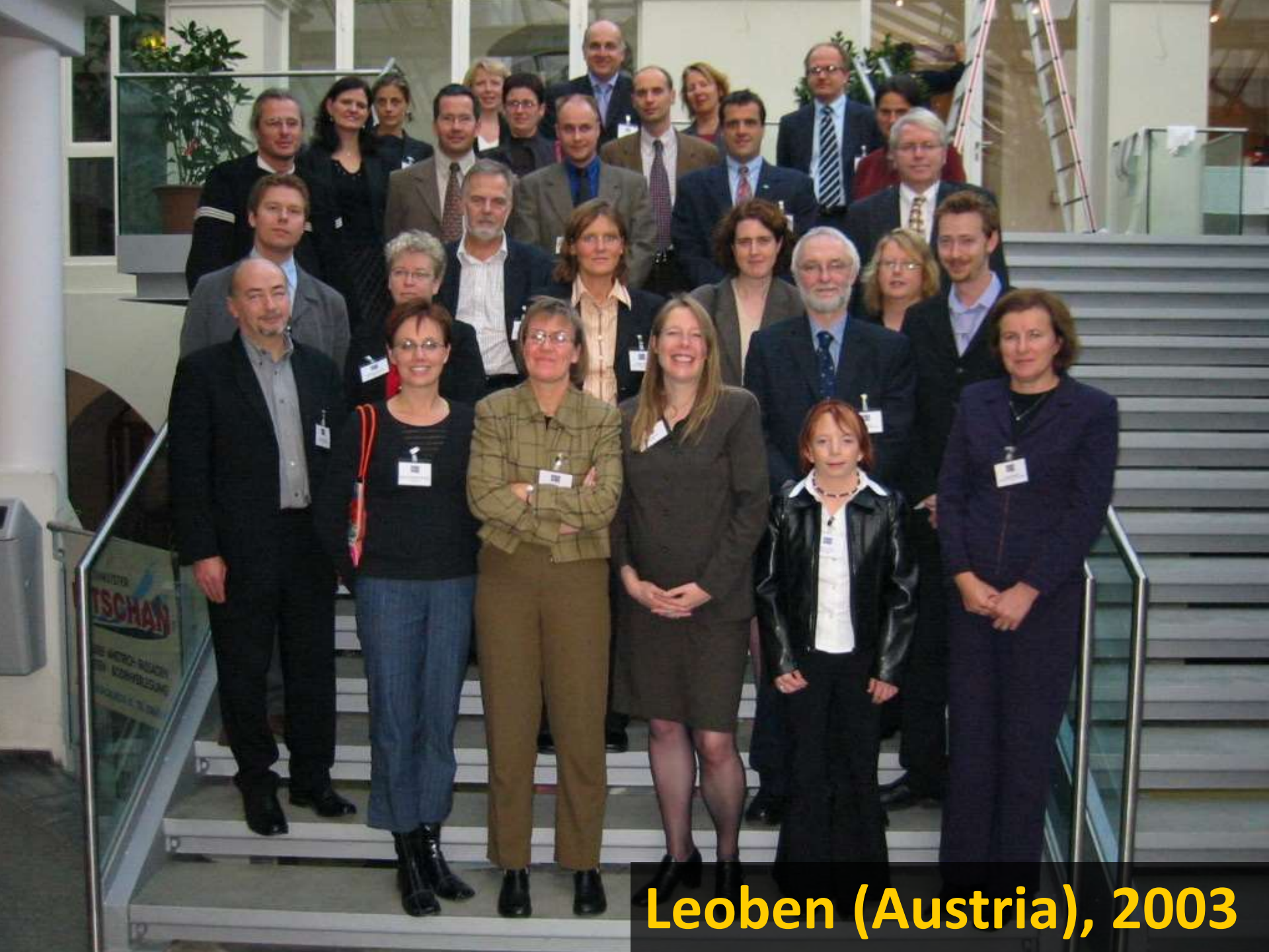
Leoben (Austria), 2003