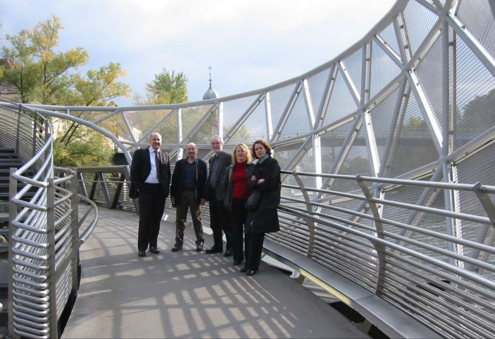
Artificial island in the river, Graz (Austria), 2003