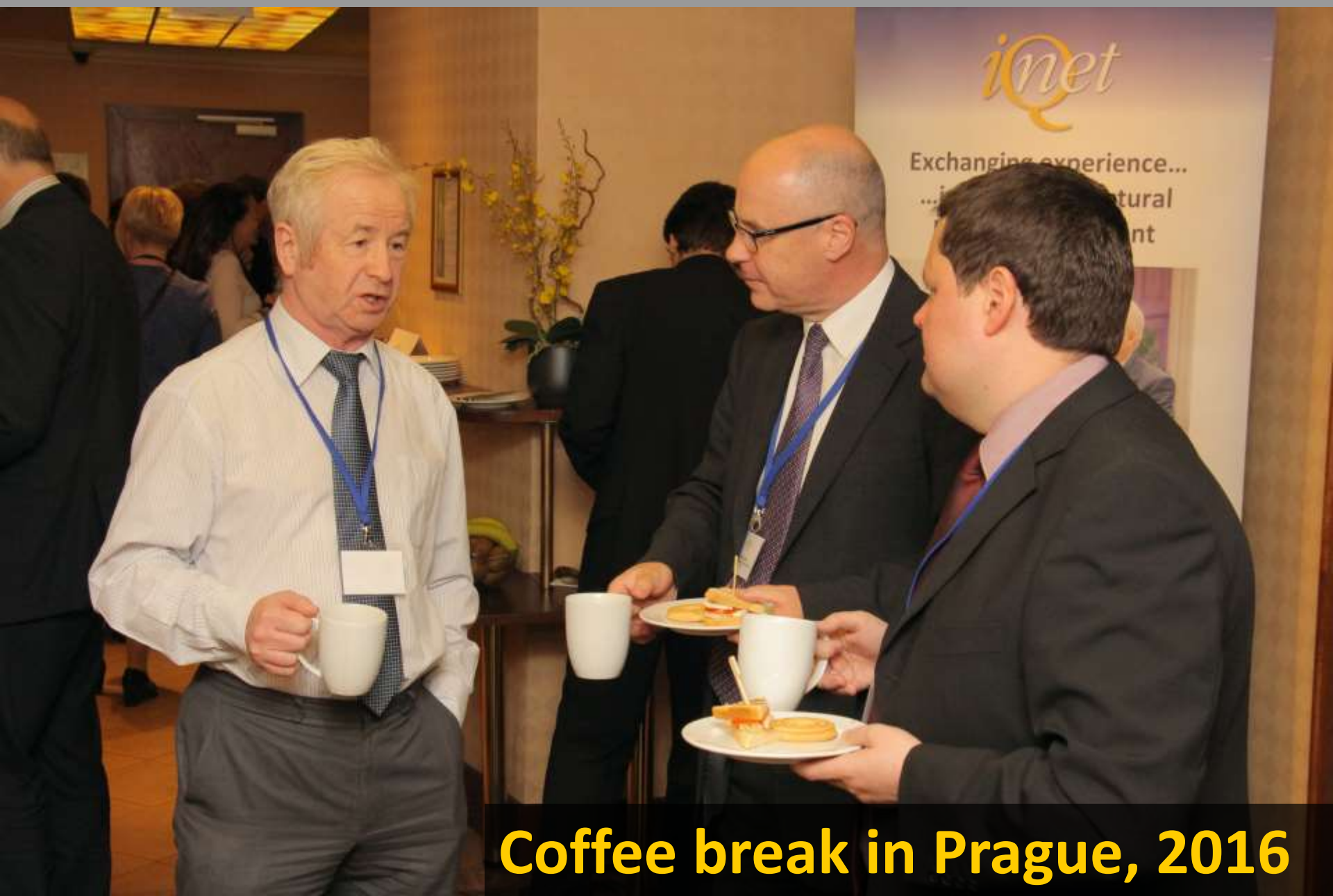
Coffee break in Prague, 2016