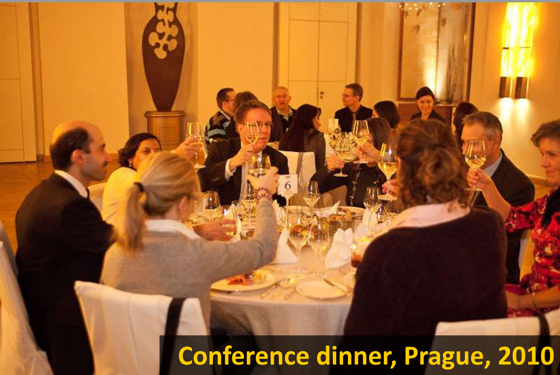
Conference dinner, Prague, 2010