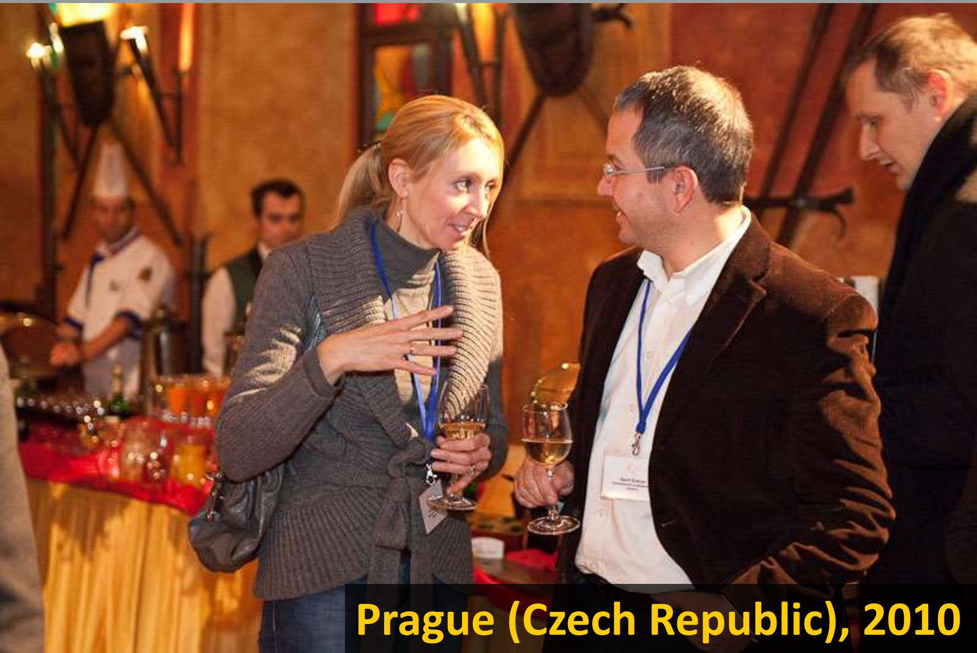
Prague (Czech Republic), 2010