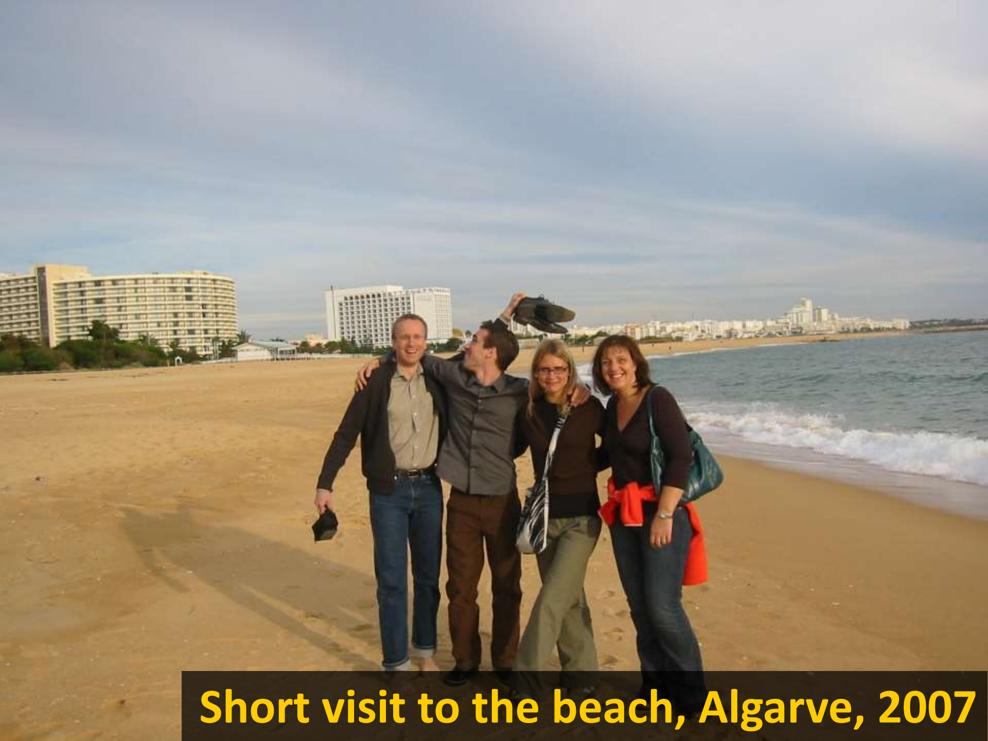
Short visit to the beach, Algarve, 2007