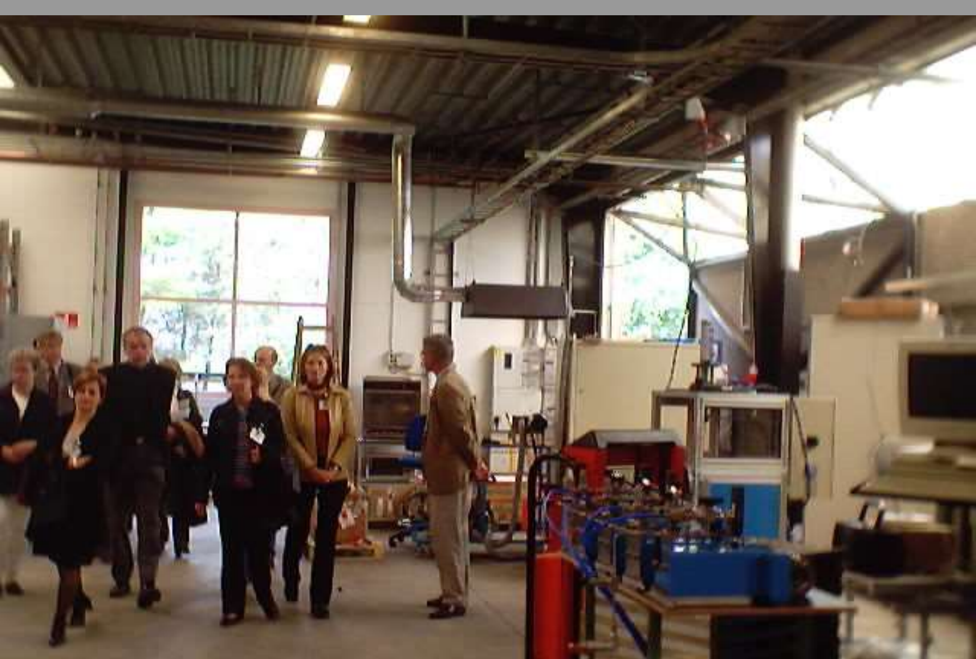
North Jutland (Denmark), 2001