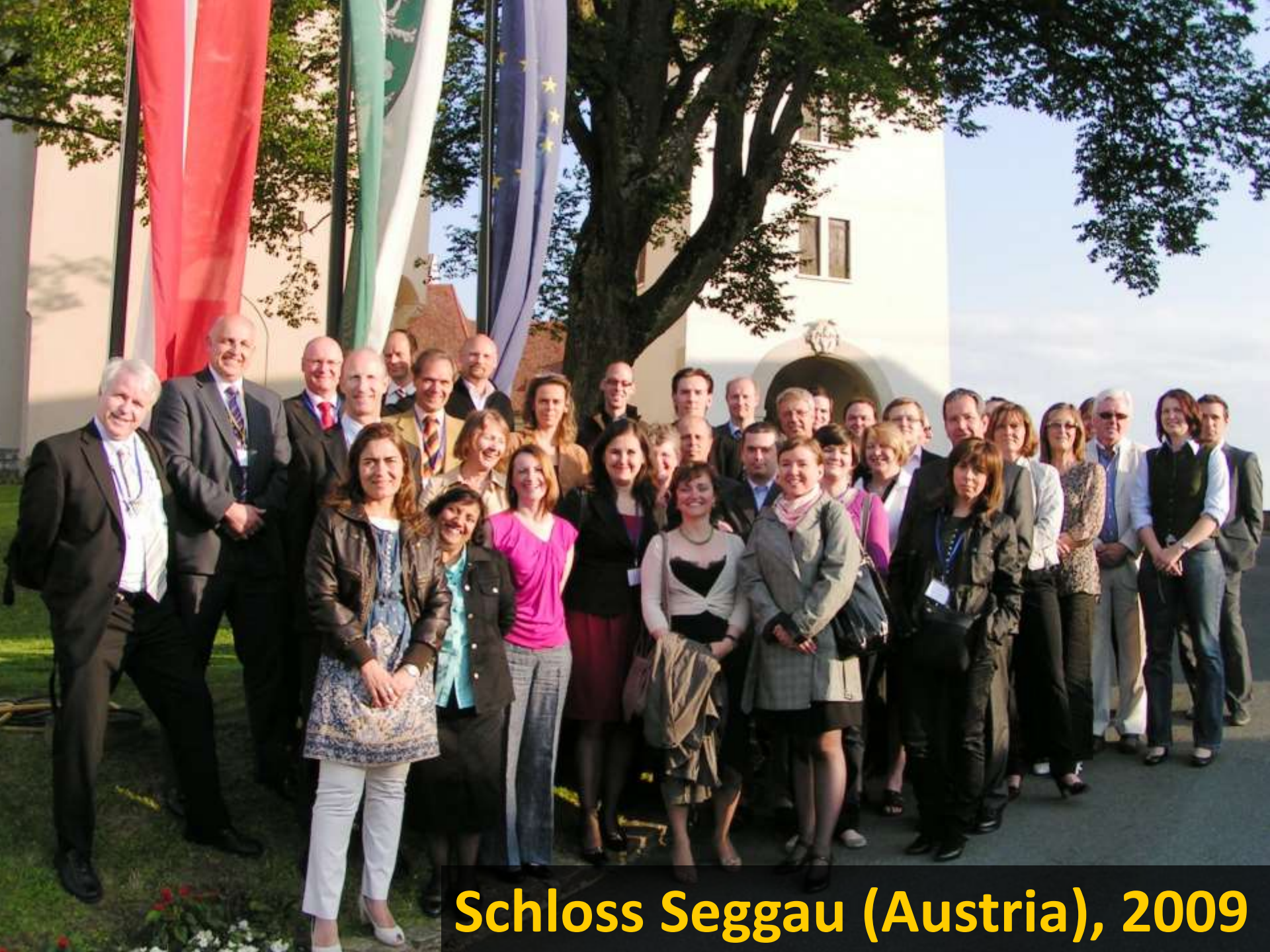
Schloss Seggau (Austria), 2009