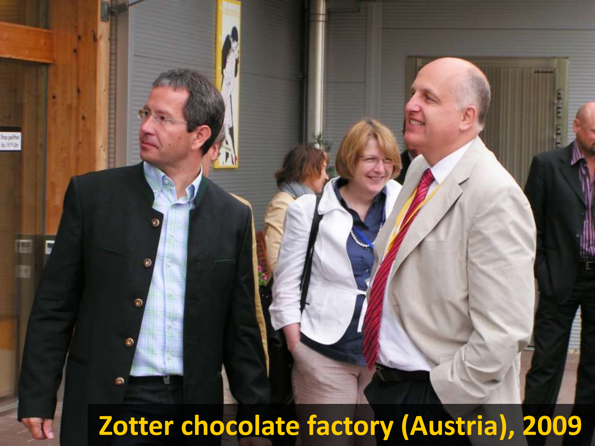
Zotter chocolate factory (Austria), 2009