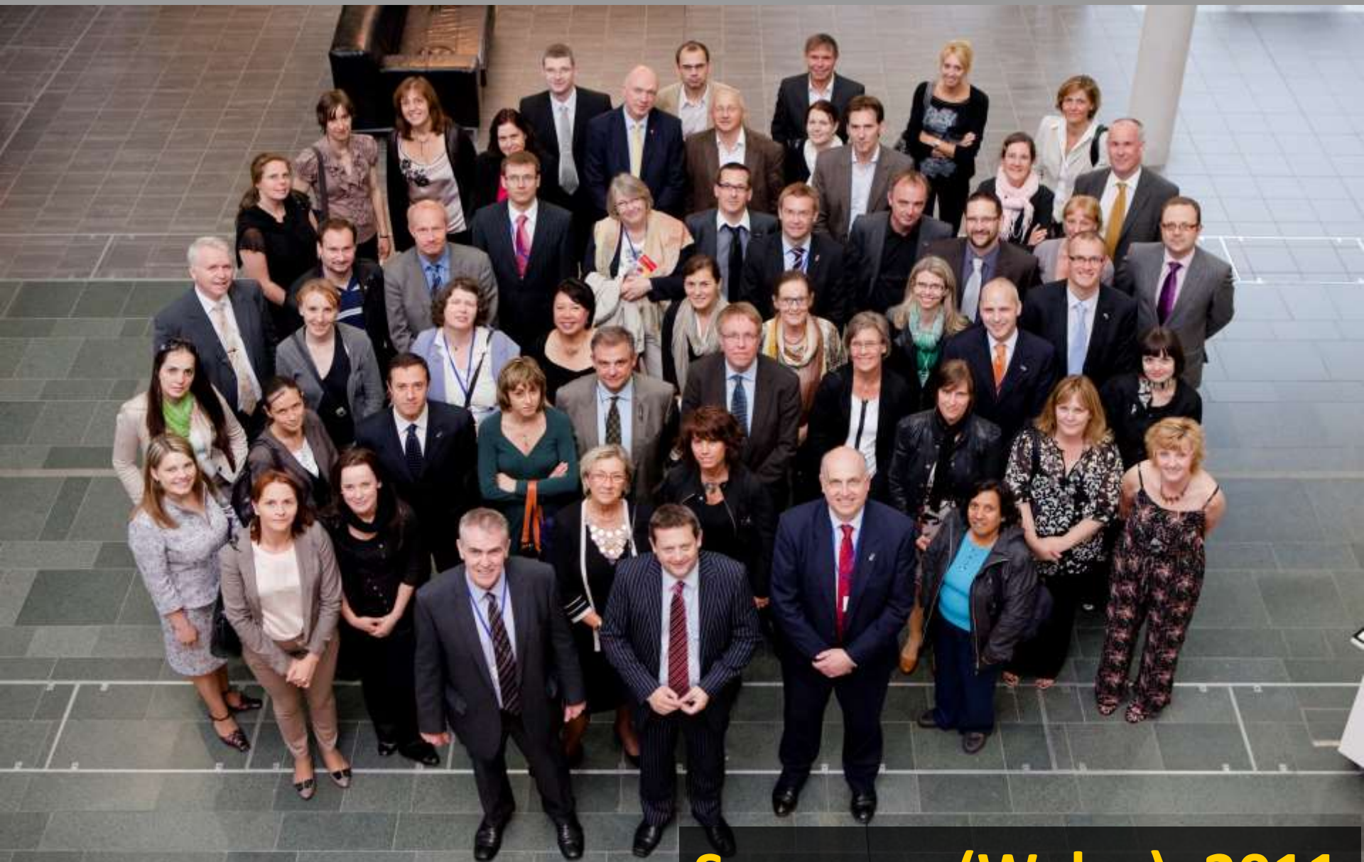
Swansea (Wales), 2011