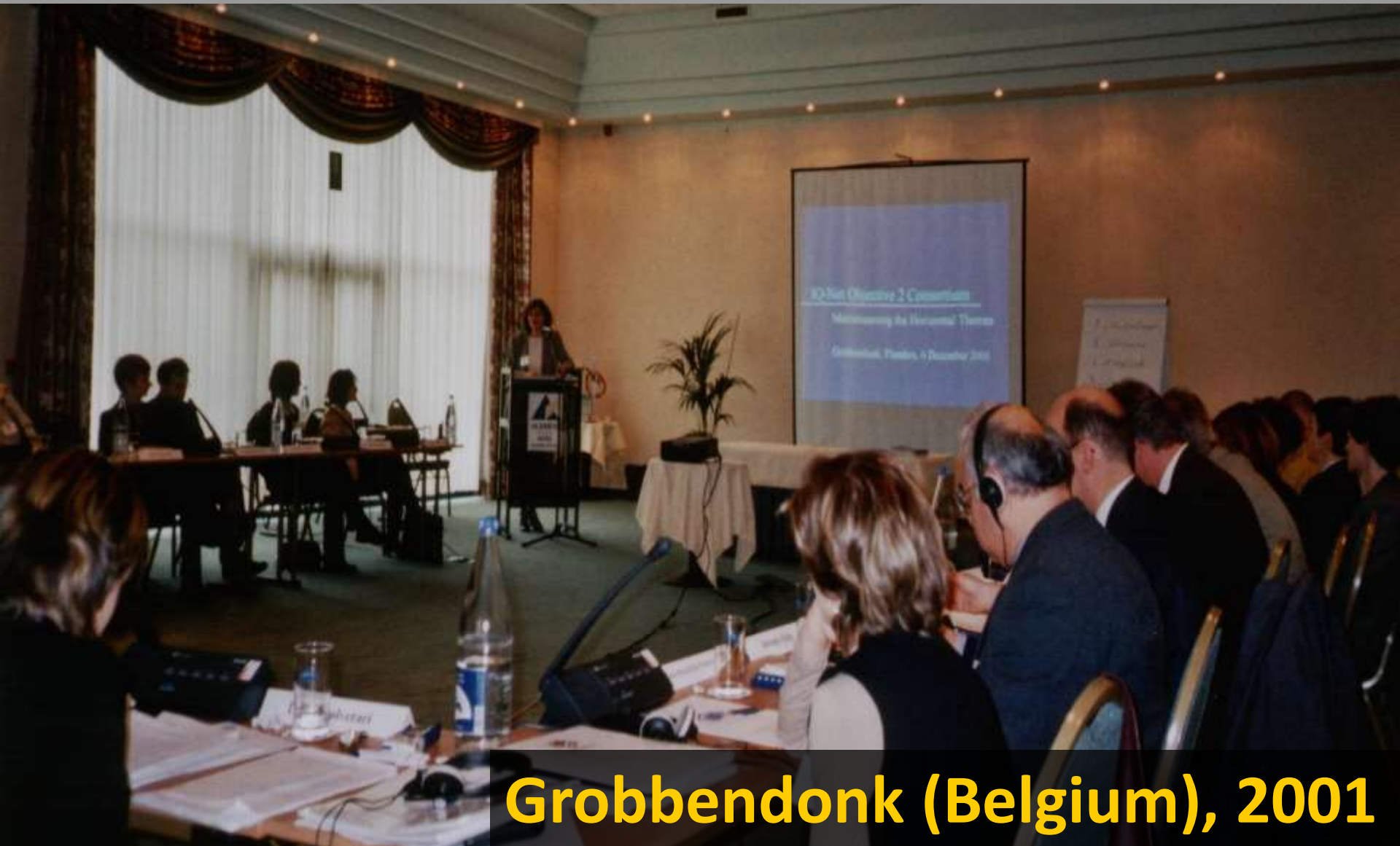
Grobbendonk (Belgium), 2001