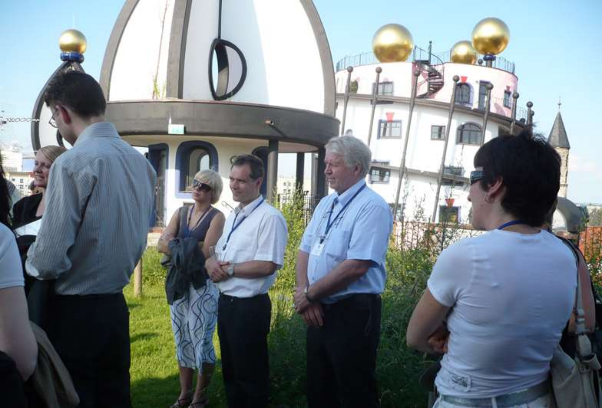
Hundertwasser Haus, Magdeburg, 2007