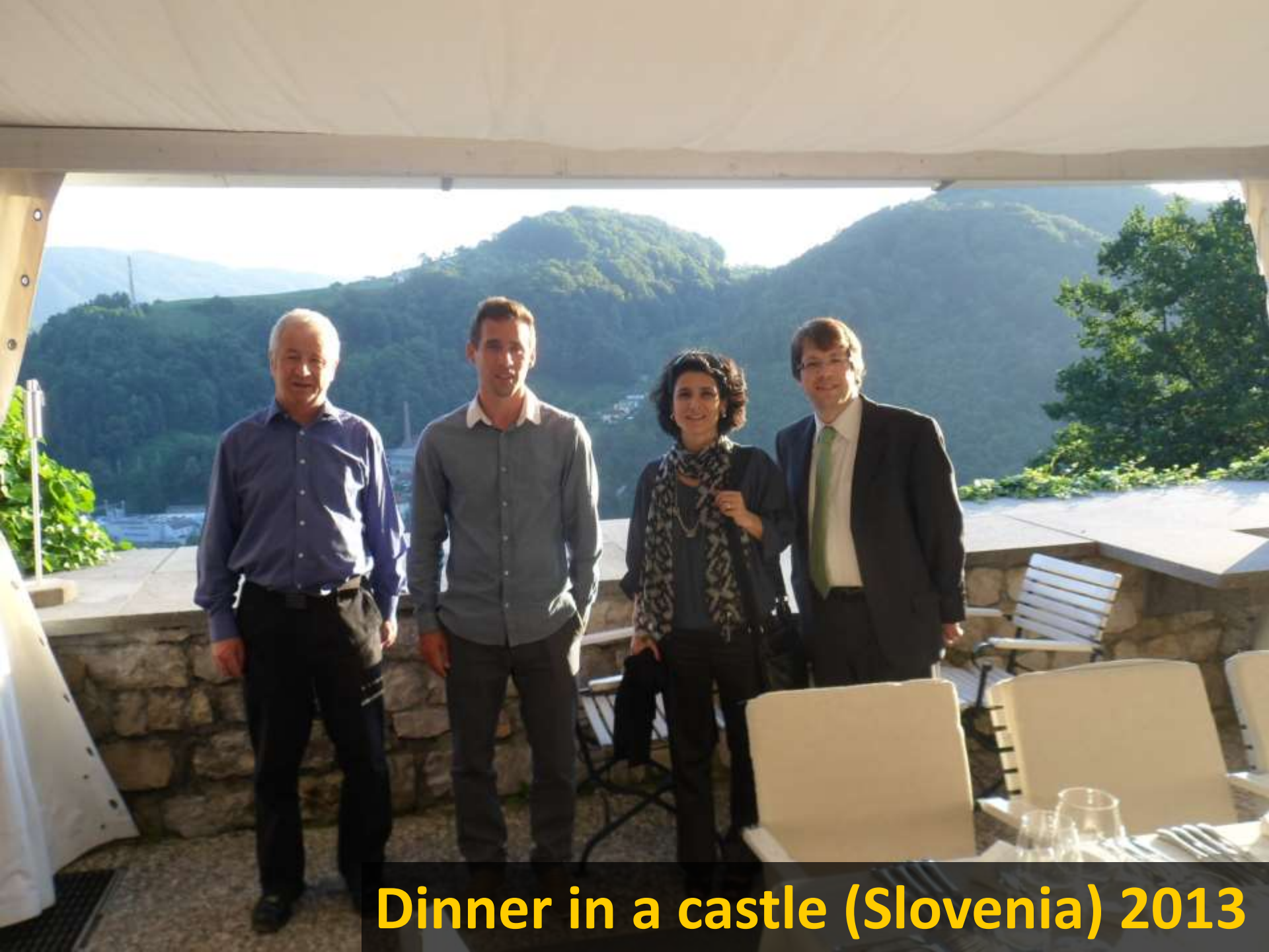
Dinner in a castle (Slovenia) 2013