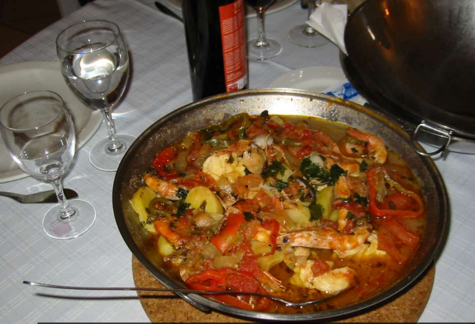
Traditional food in Algarve (Portugal), 2007