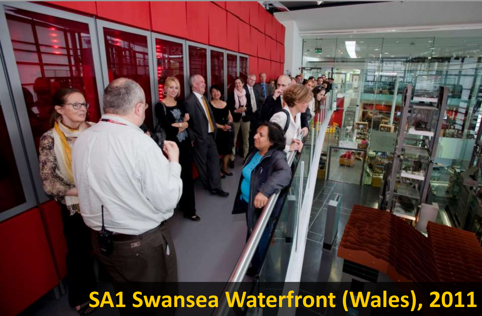
SA1 Swansea Waterfront (Wales), 2011