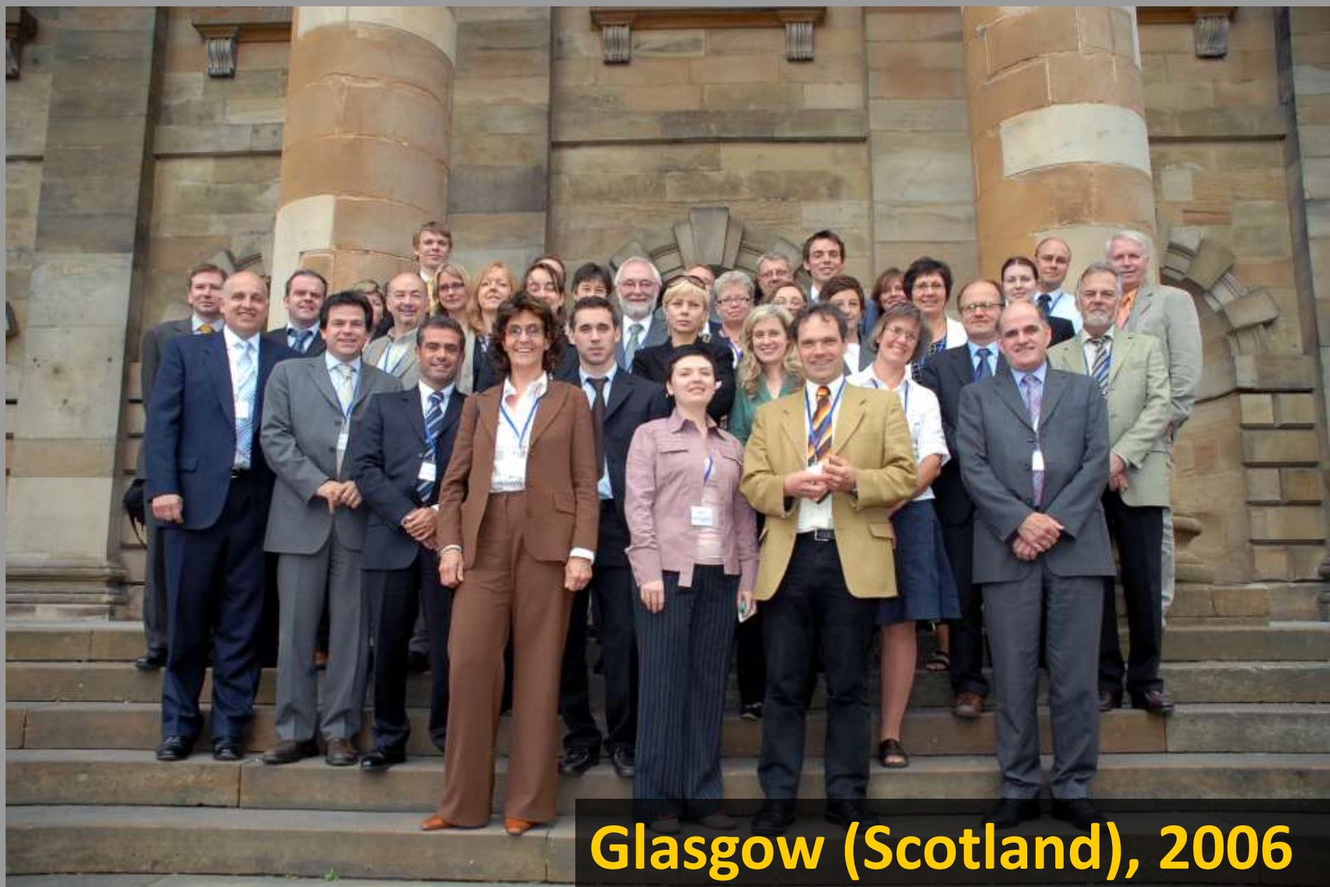
Glasgow (Scotland), 2006