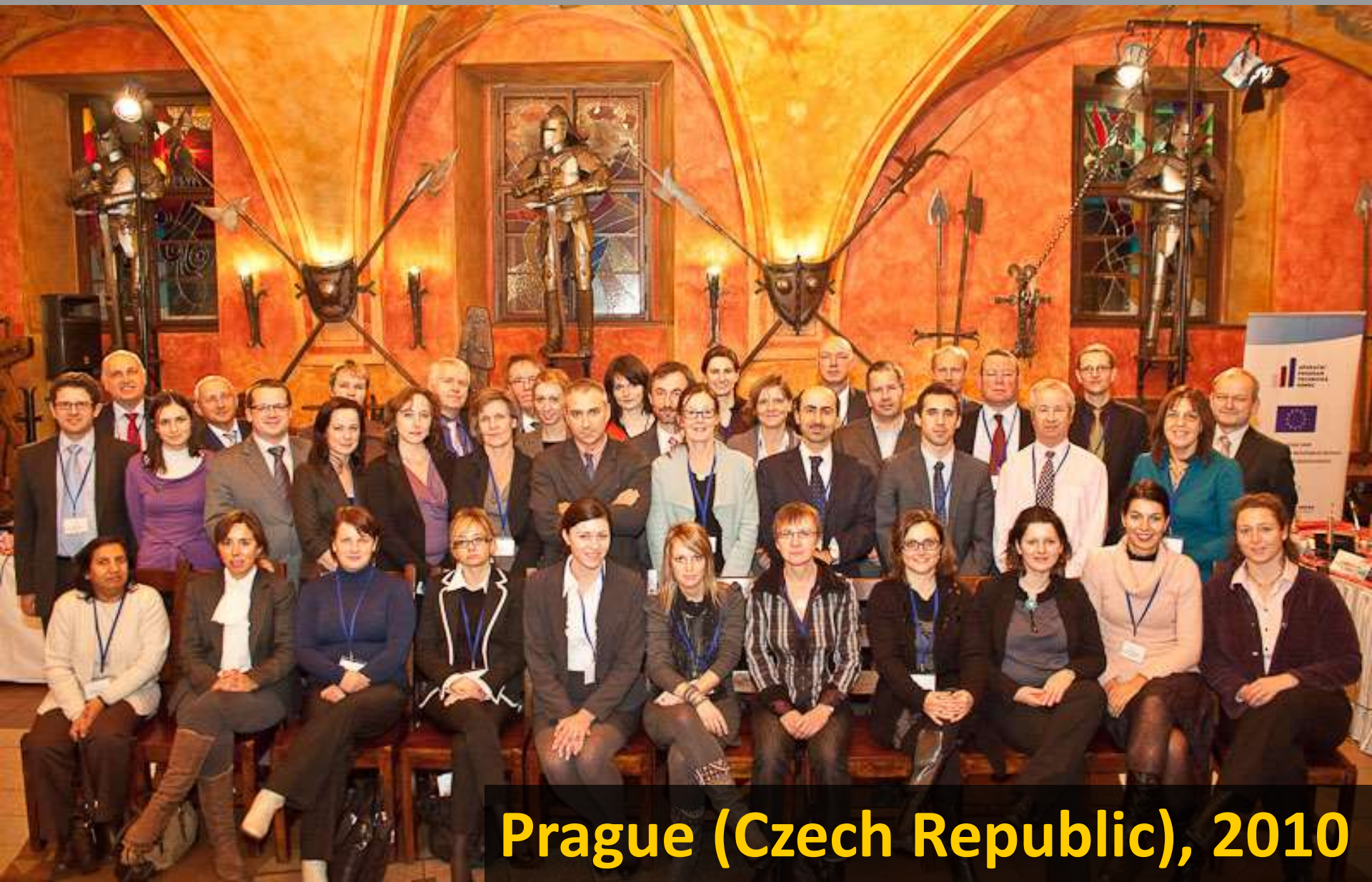
Prague (Czech Republic), 2010