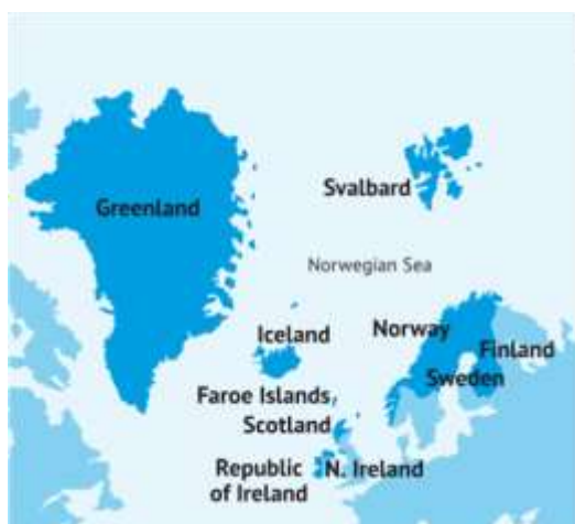
Northern Periphery and Arctic Programme