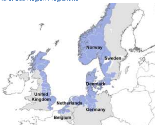
North Sea Region Programme