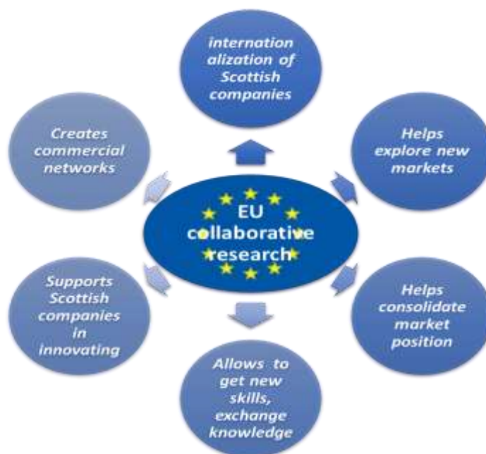
Figure 1: Benefits from EU collaboration and research for Scottish companies: