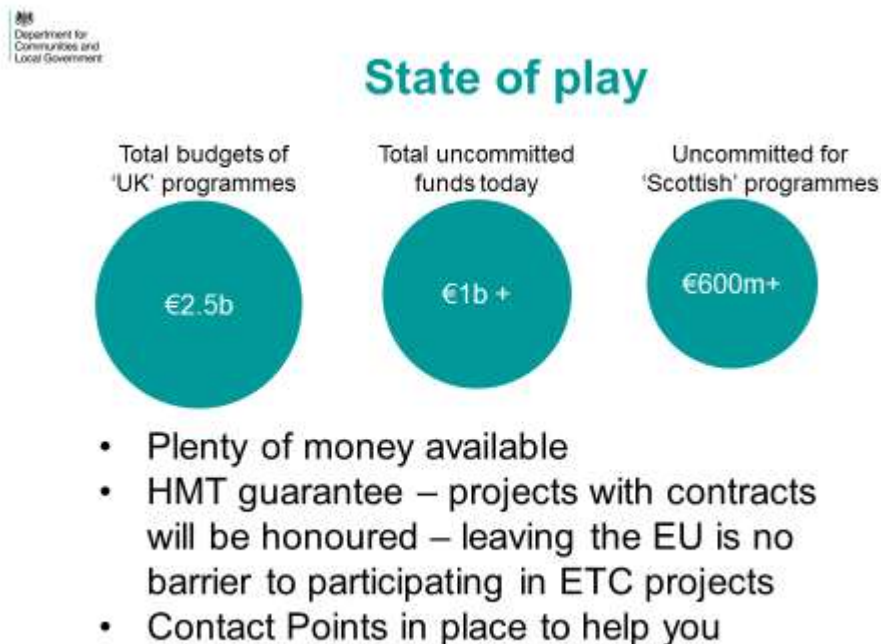
Figure 2: Current position of UK INTERREG programmes

David Anderson highlighted that INTERREG Programmes still have funding available: for example, across the seven INTERREG programmes in which Scotland participates, there is over €600 million of uncommitted funds. Tom Corker set out considerations for developing future projects (see Figure 2): what is the international need; what is the demand-led market failure; how does it fit with wider national and regional policies what will be the tangible change; how will results be durable; are the right people involved, how will projects be delivered?